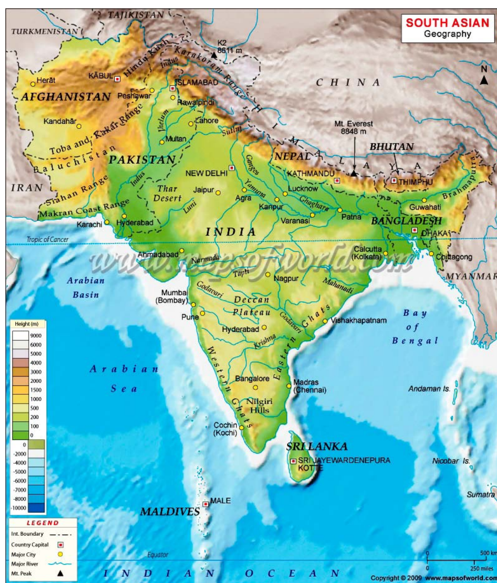
MAP 1 | Geographical Map of South Asia

for managing emerging challenges, it is not a panacea and cannot succeed alone in absence of supportive systems of governance and sound institutional policies and legal frameworks.